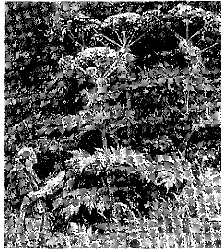
Giant hogweed, Heracleum mantegazzianum

Please also note that Cowparsnip ( Heracleum lanatum ), often seen growing along roadsides, strongly resembles Giant Hogweed and is frequently mistaken for it. Be sure to visit the CIPWG (see above) and Invasive Plant Atlas of New England (IPANE) ( http://invasives.ebuconn.edu/ipane/index.html ) websites for additional information, including descriptions of Giant Hogweed look-alikes.